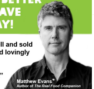
Matthew Evans Author of The Real Food Companion

"Food grown well and sold fresh and cooked lovingly is usually good for you and the environment"